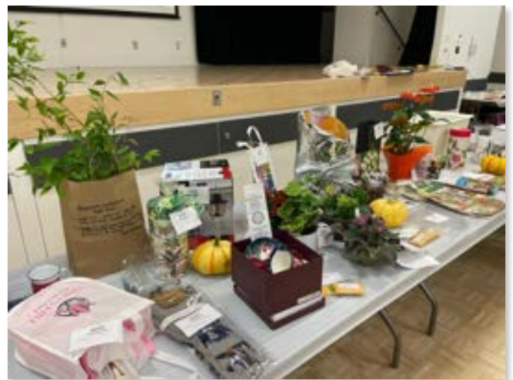
The draw table was jammed with treasures!